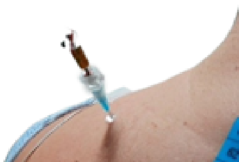
Figure 2. Clinical deployment of the fiber-optic device in a myofascial pain patient.